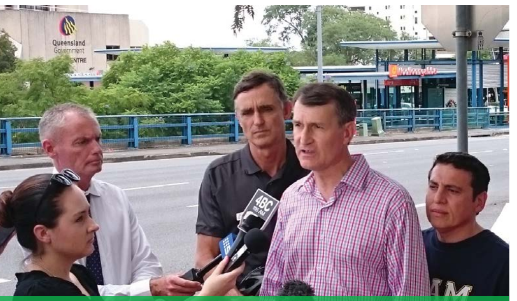
Lord Mayor Graham Quirk announced $100 million commitment to expand Brisbane's cycling network, with 35 new bikeways, including the Gabba to Goodwill Bridge Bikeway project.

State-wide, the government's commendable program of offering shared